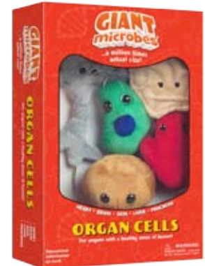
ORGAN CELLS GMUS-BX-0107