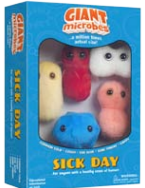
SICK DAY GMUS-BX-0103