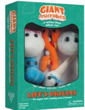
LIFE'S ORIGINS GMUS-BX-0104