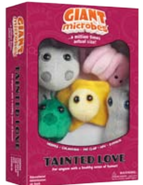
TAINTED LOVE GMUS-BX-0101