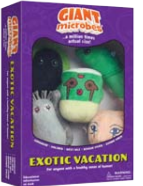
EXOTIC VACATION GMUS-BX-0109

AND MORE! COMING SOON... BLIND DATE GMUS-BX-0102 CALAMITIES GMUS-BX-0110 GUT CHECK GMUS-BX-0111 VACCINES GMUS-BX-0112