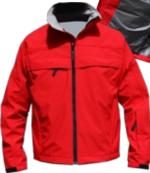
FBI Academy FTU Range Jacket right, matching softshell left. Aluminum-print lining extra warm.