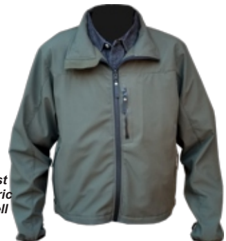
3-in-1 NY State Forest Rangers, 3-layer fabric in both the outer shell and softshell!