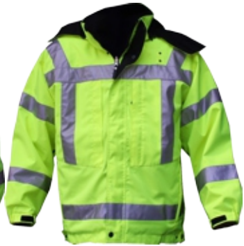
MAINE STATE POLICE Reversible Patrol Jacket, Waterproof-breathable both sides