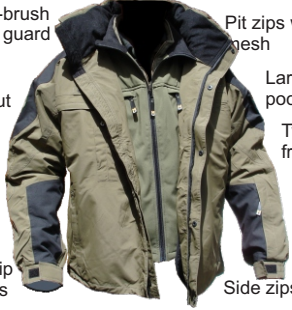
Virga Jacket with matching softshell