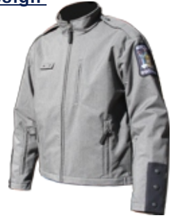
Trooper Softshell (NYSP Heather Grey)

3-Layer jackets with Matching Virga Softshell in Stock (Variations worn by Regina Police Service, PPD Counter Terrorism Unit, NH Fish and Game, Lexington PD, North Dakota Parks and Rec, plus others)