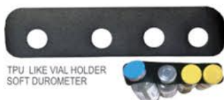
TPU LIKE VIAL HOLDER SOFT DUROMETER