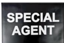
2D PVC VELCRO PATCH