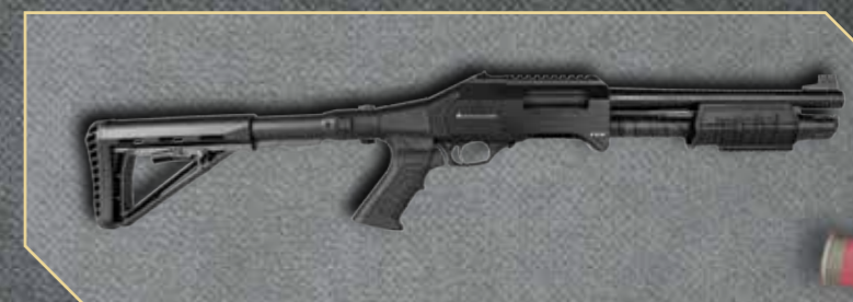
OP TAC 100 - I