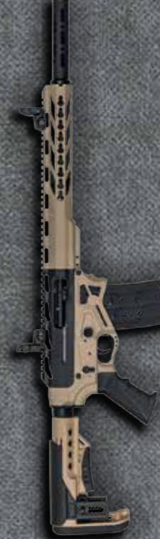
Tactical Mag Fed