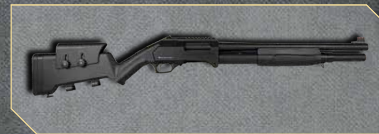
OP TAC 100 - II