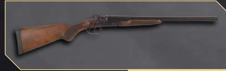
OB SS 12