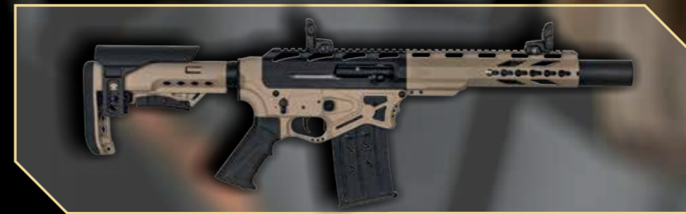
Desert Sand Compact