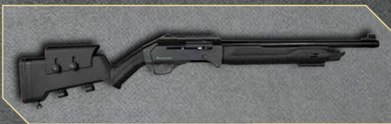
OP TAC 200 - I