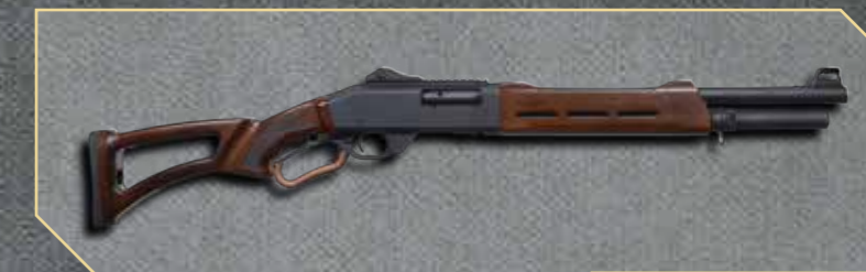
LR 12 TAC