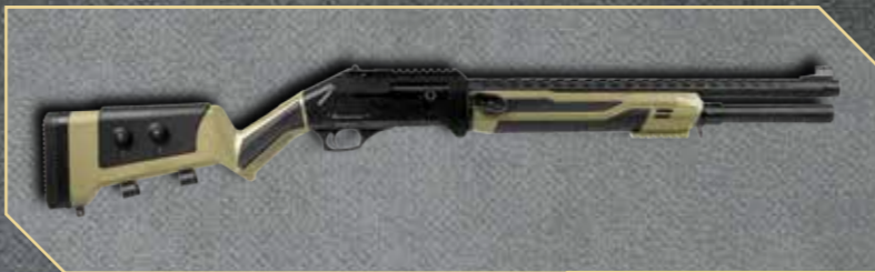
OP TAC 200 PRO