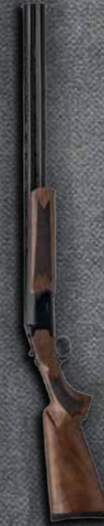
Over & Under