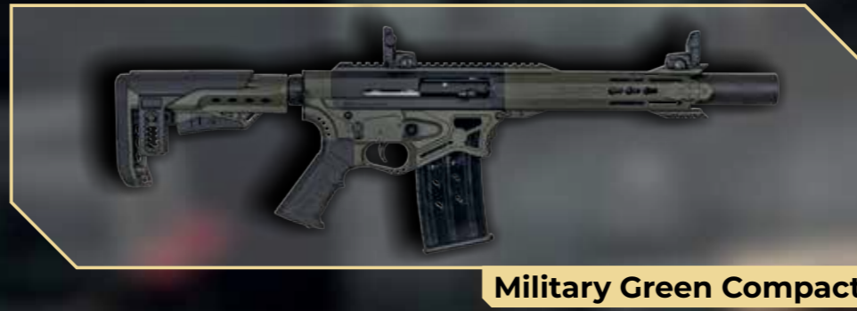
Military Green Compact