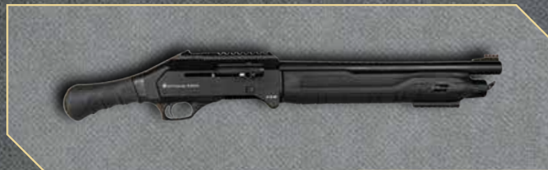
OP TAC 200 SPG