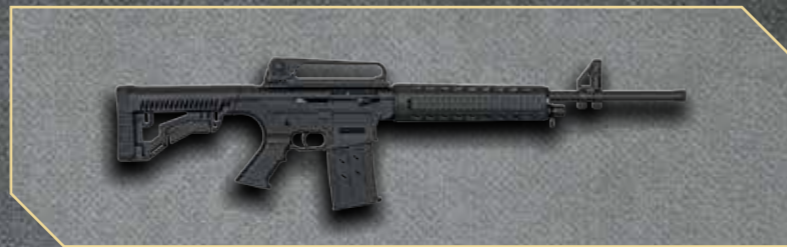
OPT VM G1 20