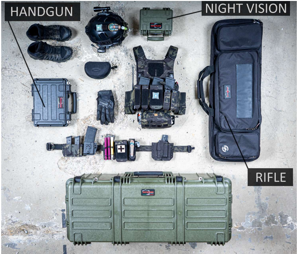
Figure 2: All items shown in this picture fit in the 9433