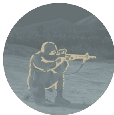
Fused outline mode