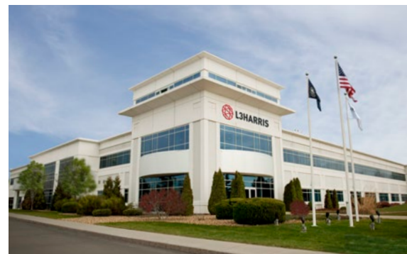
Londonderry, New Hampshire Facility