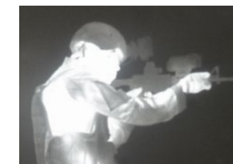
White hot view