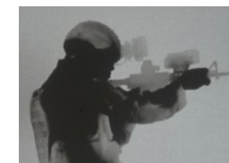
Black hot view