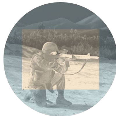
White-hot fused overlay view