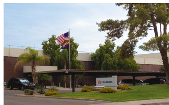
Tempe, Arizona Facility