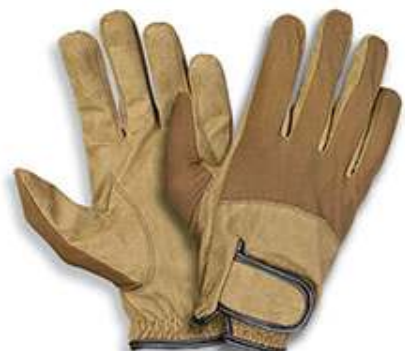
Gloves 60-0283 M/o Washable Amara Light Weight Gloves