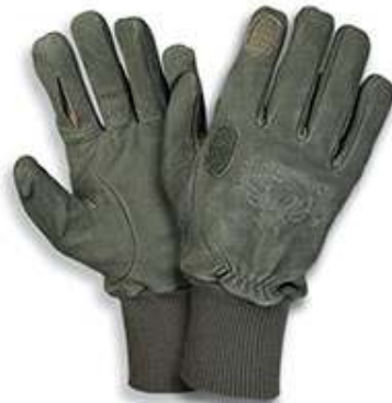
Gloves 60-0274 M/o Cow Nubuck Leather