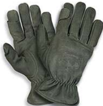
Gloves 60-0277 M/o Cow Nubuck Leather