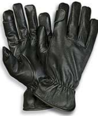
Gloves 60-0279 M/o Goatskin Leather