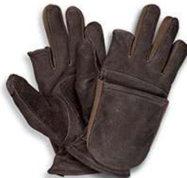
Gloves 60-0282 M/o Real Leather