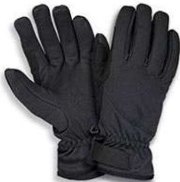
Gloves 60-0276 M/o Polyester with winter lined