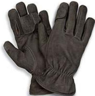
Gloves 60-0278 M/o Cow Nubuck Leather