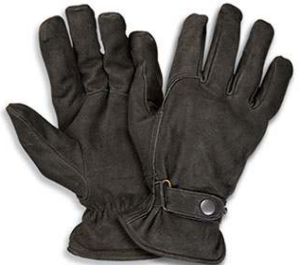
Gloves 60-0280 M/o Real Leather