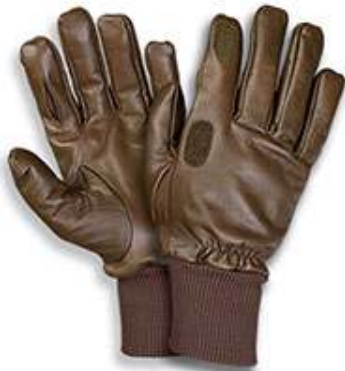
Gloves 60-0273 M/o Cow Analin Leather