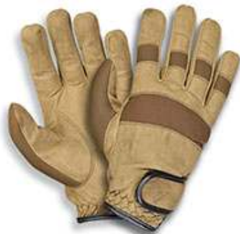
Gloves 60-0281 M/o Washable Amara Padded Gloves