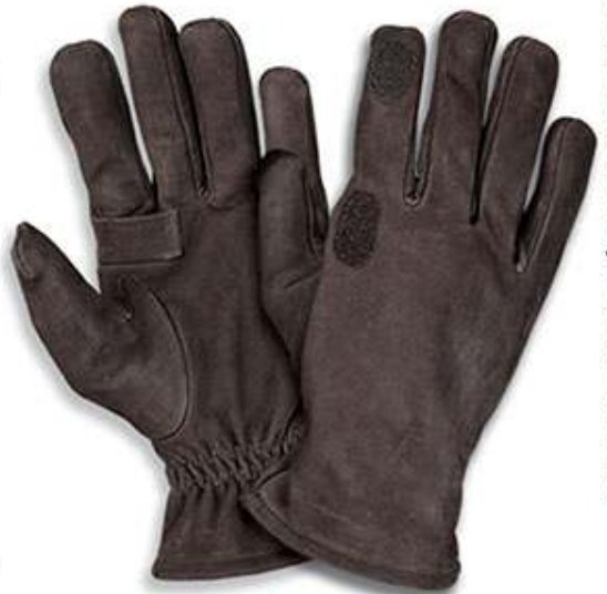
Gloves 60-0275 M/o Cow Nubuck Leather