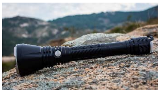
Max 1300 Lumens

Dual purpose long-range flashlight, Fenix's 1 st flashlight with a CREE XHP35HI LED, innovatively fitted with a multi-functional taillight. A deep metal reflection cup allows the LED to throw the beam up to 700 m. A diffused tail light, fitted with white and red LED's, operating independently, aids in reading, camping and distress signalling.