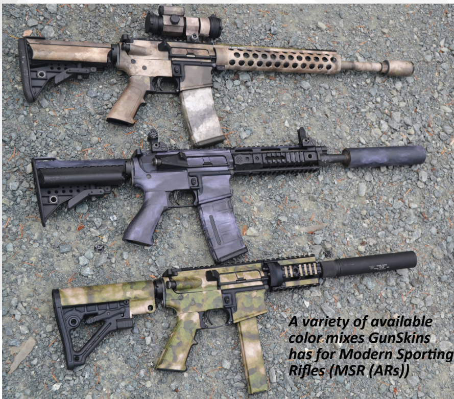
A variety of available color mixes GunSkins has for Modern Sporting Rifles (MSR (ARs))