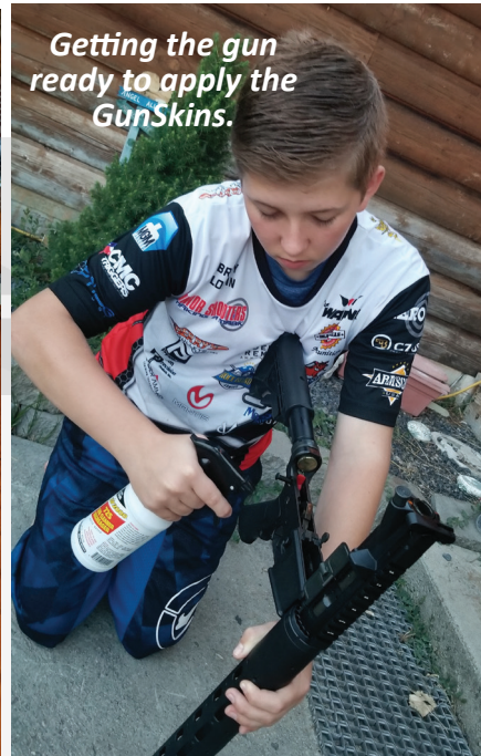
Getting the gun ready to apply the GunSkins.