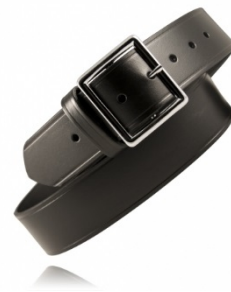
1 ¾" Garrison Belts