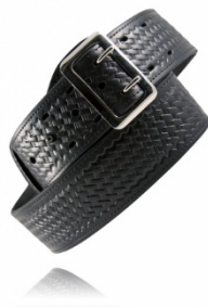
2 ¼" Sam Browne Belts