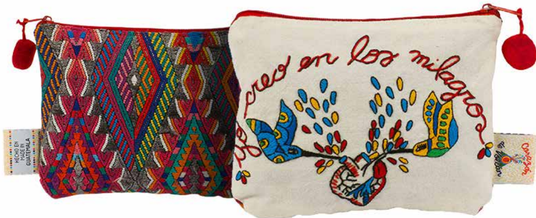
"I believe in miracles" vanity case (ECG001)