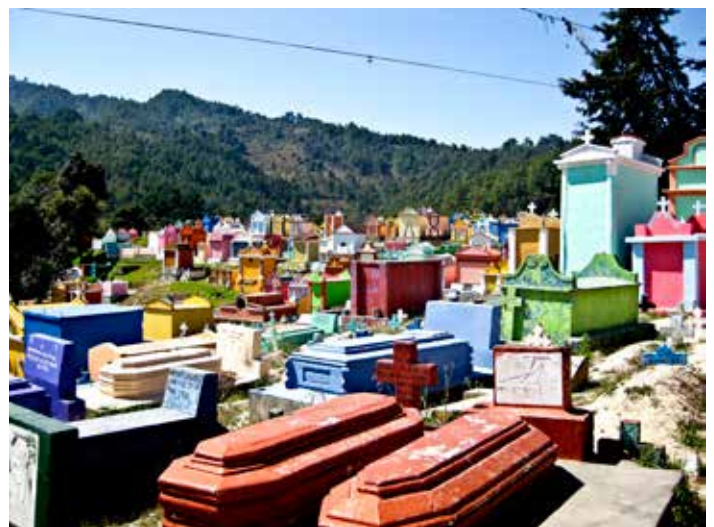
Colorful Cemetery at Chichicastenango

Guatemala has spoiled us with an overflow of constant inspiration. Some of the many gifts that inspire us include colors on the front of houses, adobe villages, smiles of friends, the always present volcanoes on the horizon, colorful cemeteries, traditional festivities, giant kites, ancestral forces, the sky with its diversity of shades of blue throughout the whole year, the mixture of our Mayan ancestors and the grandparents that arrived later on, each flower, each bird in the huipiles, the immense natural diversity, friends, parties, love, love and love for everything that surrounds us.