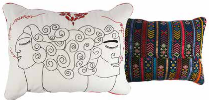
"In my dreams I find you" pillow cover (FAM011)