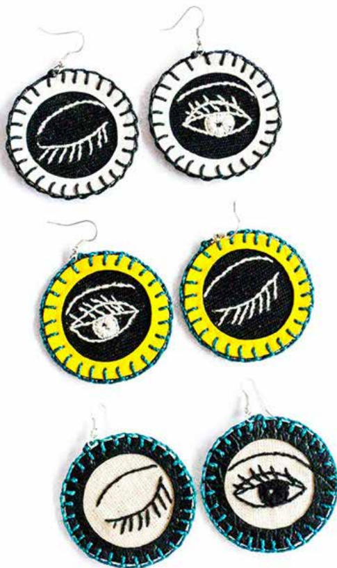
"Blinking eyes" earrings (AR008)