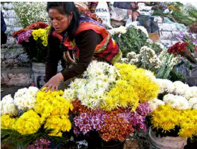
Flower seller in Chichicastenango