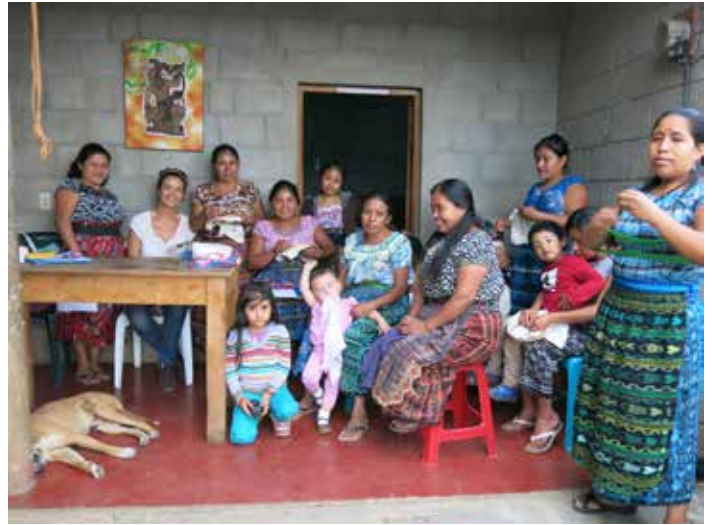
The Corazón de Volcán artisans at San Juan la Laguna

We carefully choose each piece of fabric so that it may retain its meaning and become part of a new piece. This makes each object unique; there is no one like the other. Each piece has its own personality and symbolism. We also love to use natural dyes.