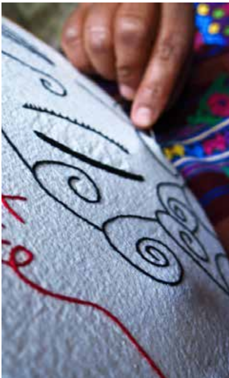
Every design is made stitch by stitch