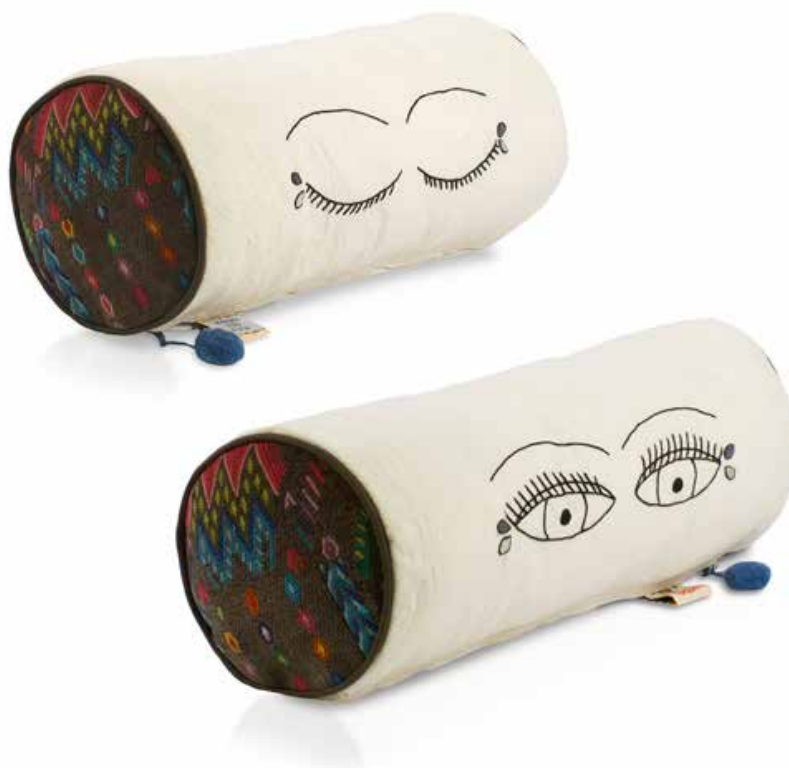
"Close & open eyes" tubular cushion cover (FCJT040-41)