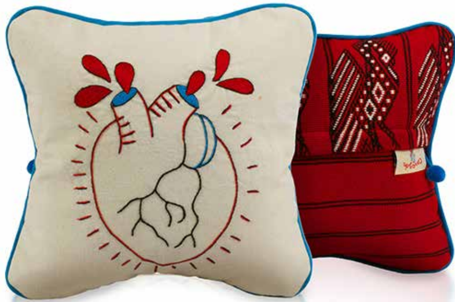
"Beating Heart" mini-cushion cover (FCJP028)