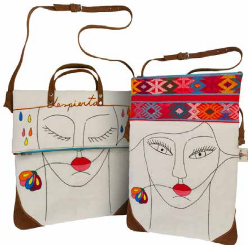
"Wake up" folded hand bag (BGC004)