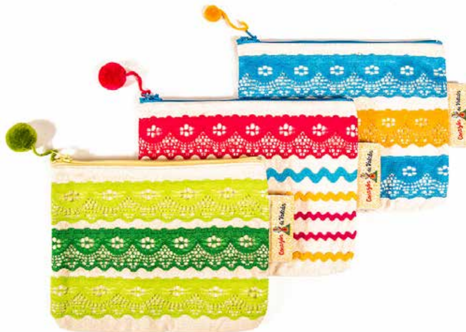
"Lace" ric rac vanity case (ECPAPL)