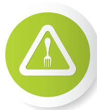
SCIENCE & TECHNOLOGY