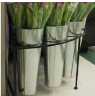
Floral Cone Galvanized Steel Finish 6.5" Diameter Top x 4.38 Dia. Bottom x 15.75" Tall