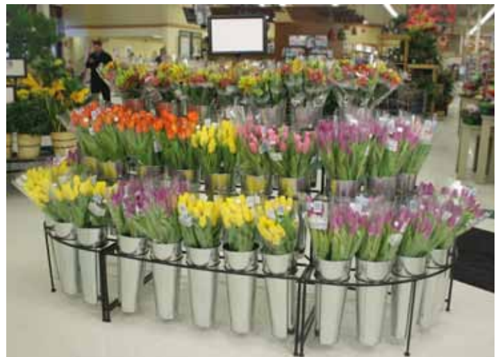
This configuration above holds thirty-three 16" cones. This display consists of quantity of two - 78015721 and four - 78015621. See diagram to the left.