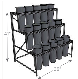
3 Tier 38" Straight Section Black Steel with 15 Galvanized Steel Floral Cones Item #78015721