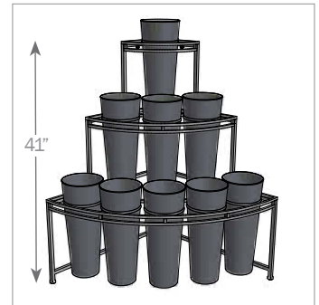
3 Tier Quarter Round Black Steel with 9 Galvanized Steel Floral Cones Item #78015621