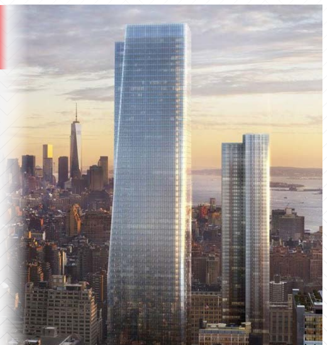
Manhattan West North Office Building, NYC