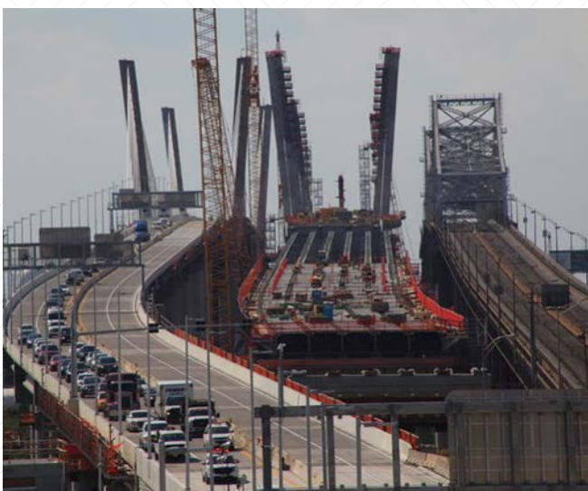
Goethals Bridge, NYC/NJ

Serving the South, Southwest, Midwest, and Mid-Atlantic states