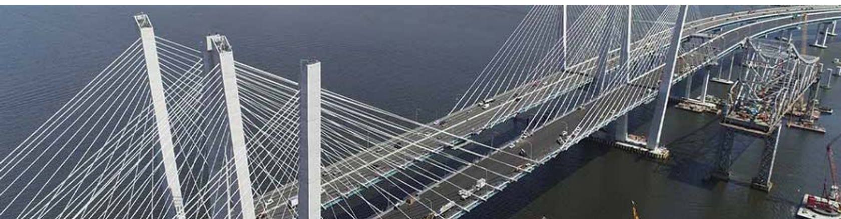
TappenZee Bridge, NYC

Our growth has been centered on the heavy construction industry, which includes large industrial projects, bridge construction, complex steel structures, and high rise buildings. Our more than 750,000 square feet of warehouse space contains more than 86,000 line items of fasteners.