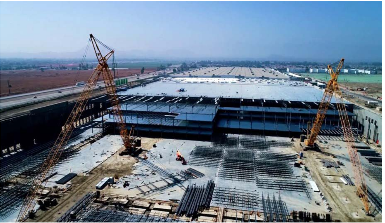
Amazon Fulfillment Center, OH