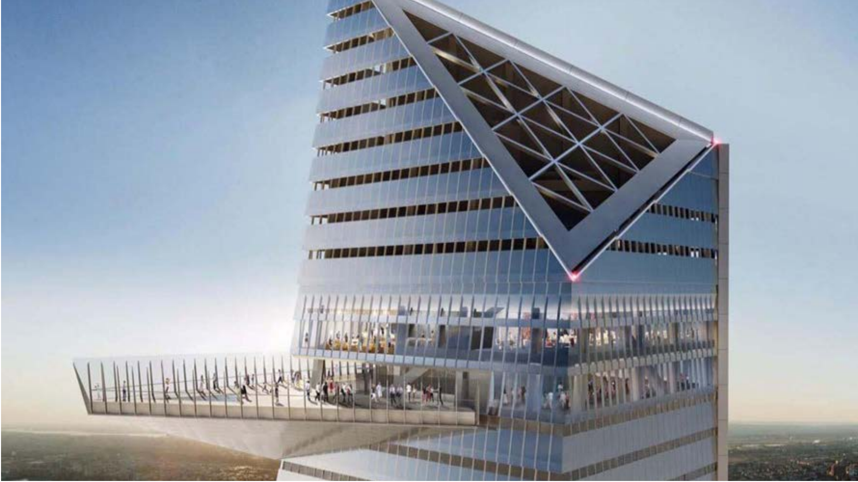
Tower A at Hudson Yards, NYC