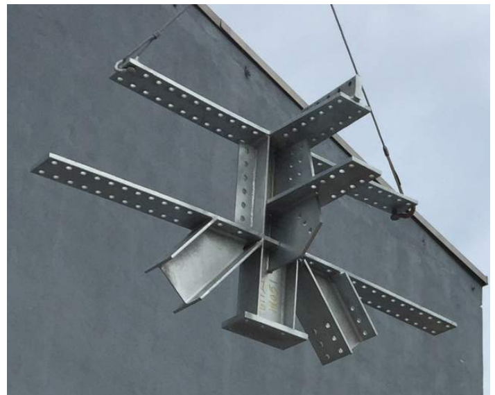
Complex Braced Frame Connections