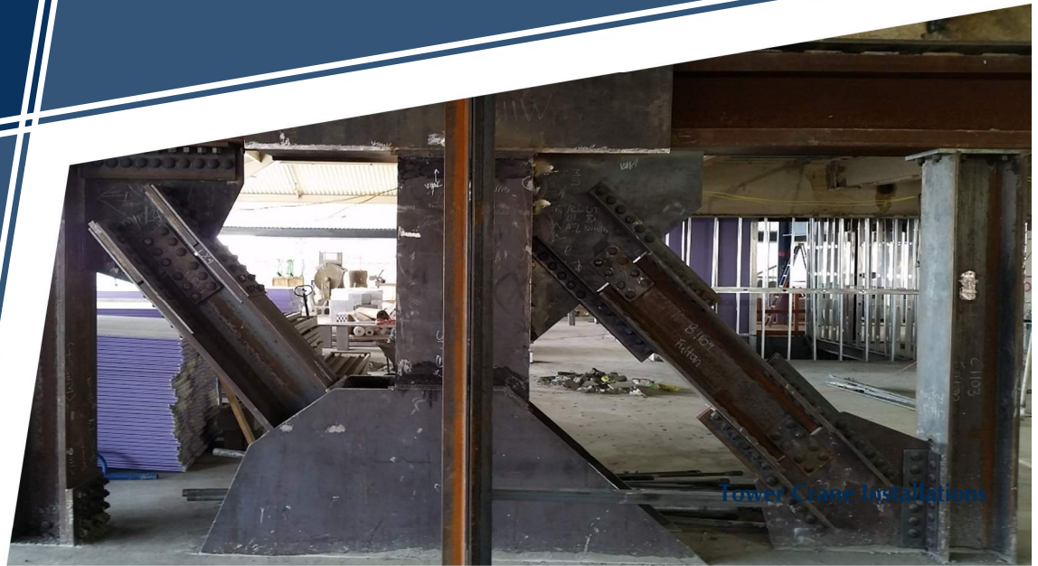
In-Situ Truss Retrofit