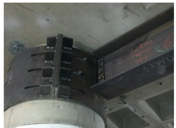
Unobtrusive Connection Retrofits