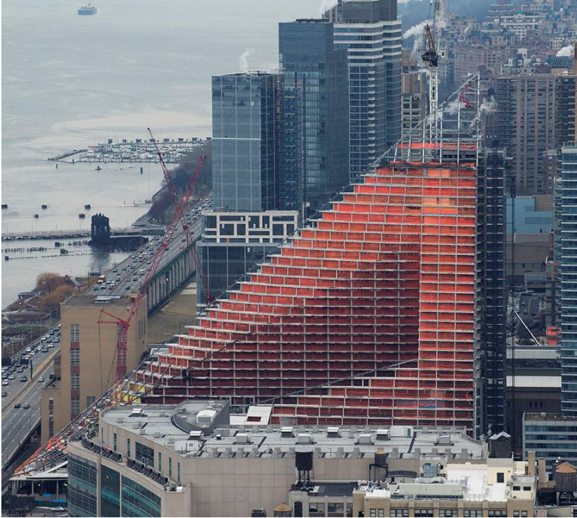
Complex Connection Design