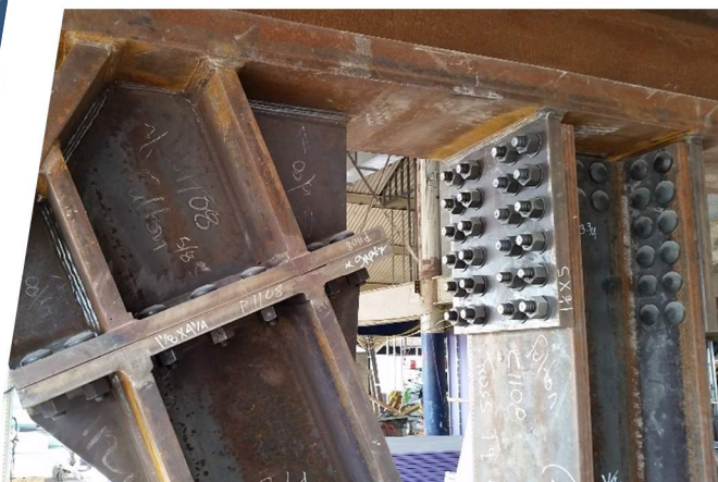
Field Bolted Connections