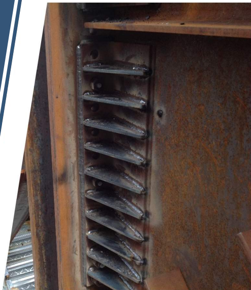
Reinforcing of Existing Connections