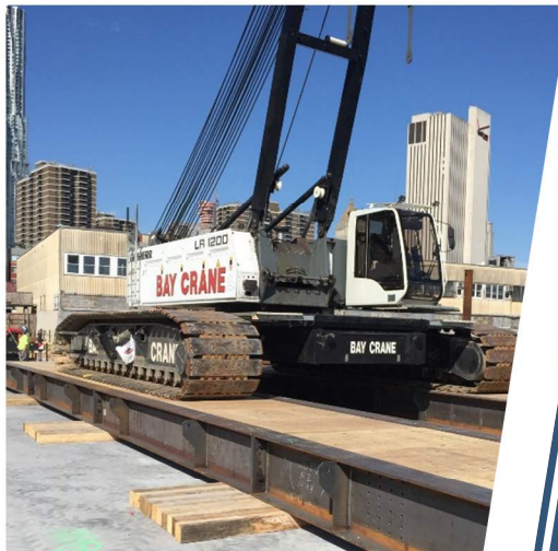
Temporary Crane Platform