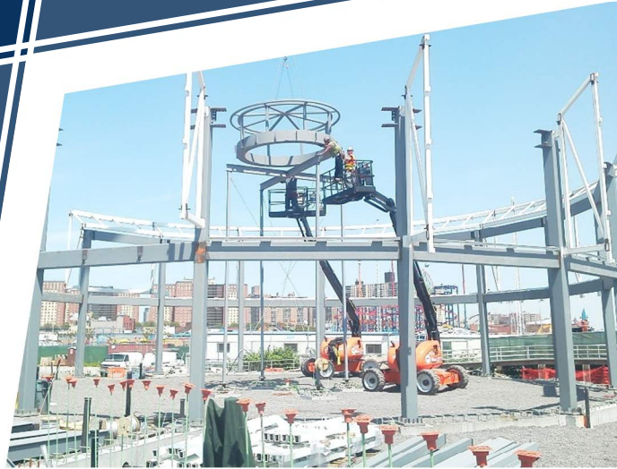
Temporary Shoring and Bracing