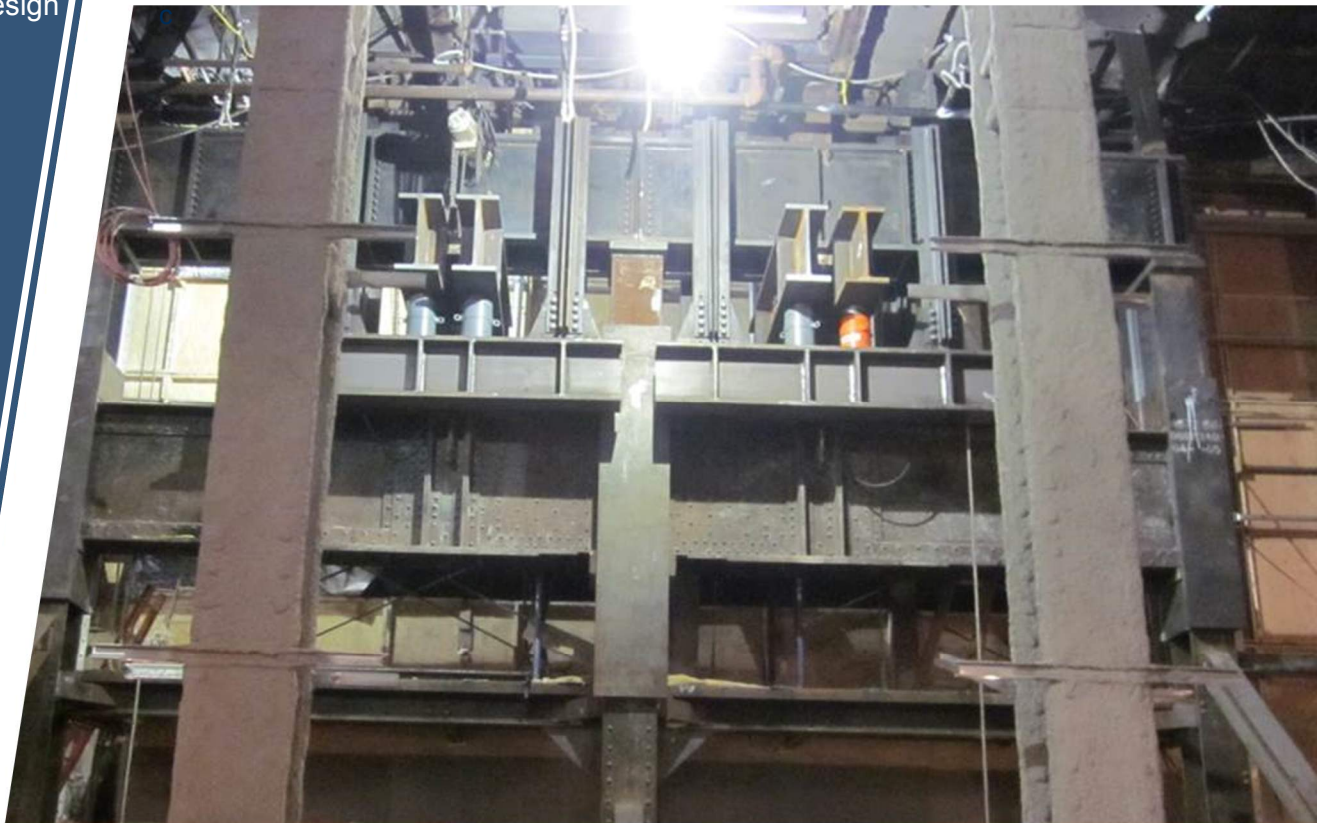
Jacking & Removal of Column & Transfer Girder for 1,000,000 lb Load New York City