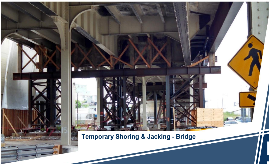
Temporary Shoring & Jacking - Bridge