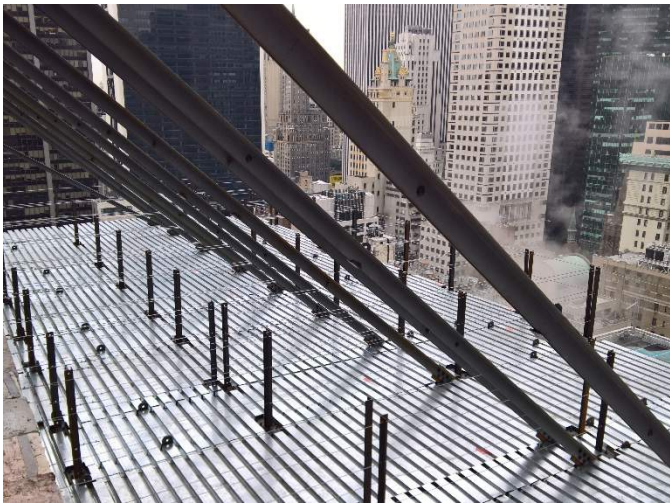
Protective Decks & Safety Netting