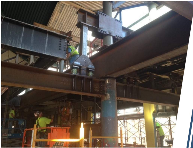
Temporary Shoring & Jacking - Building