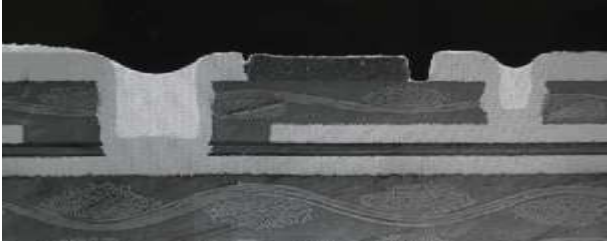
Cross section of PCB incorporating FaradFlex®