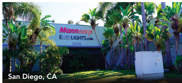
San Diego, CA