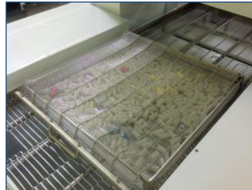
Small Plastic parts run in baskets