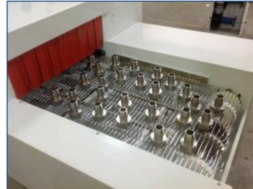
Stainless Steel Parts Exiting the Nu/Clean Industrial Cleaner

Due to the high demand for industrial parts cleaning, Technical Devices Company has developed specially designed inline cleaners for industrial cleaning processes. In fact these cleaners have proven so successful and cost-effective, there are currently 4