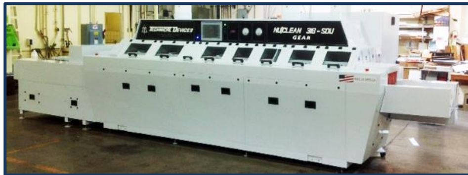
Nu/Clean Industrial Inline Cleaner

( We just delivered our 4 th parts cleaner to a Major Electric Car Manufacturer! )